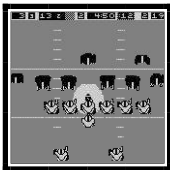
“Zoom In” View lets you get up close & personal

The “ Chalkboard Editor ” module lets you build your own playbook, designing offensive, defensive, and special teams plays to prepare for any contingency. With your team & playbook ready, it’s time to play Playmaker , but be prepared for a battle of wits.