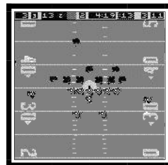
“Zoom Out” View allows you to watch the play unfold